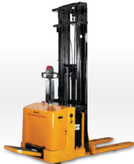
Electric Pallet Trucks