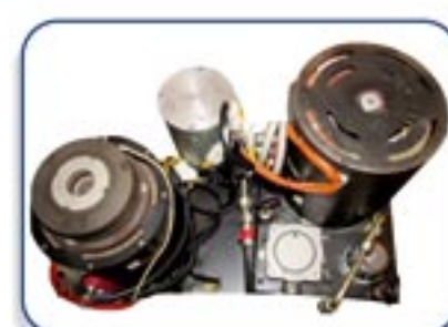
Powerful AC Motors